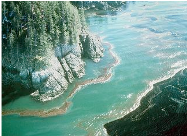
Oil from the Exxon Valdez approaches a rocky cliff in Prince William Sound.

That argument seemed to hold little water with several justices.