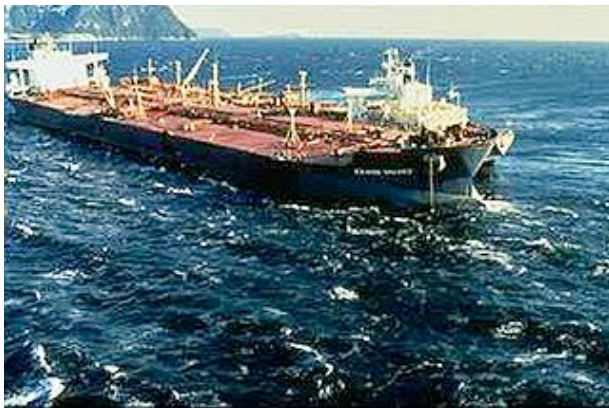
The leaking Exxon Valdez remains grounded on Bligh Reef three days after the incident.

www.Chatterbean.com/Romantic Ads by Goooooogle