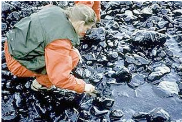
Shortly after the spill, a NOAA scientist measures the depth of oil from the Exxon Valdez on a beach in Prince William Sound.