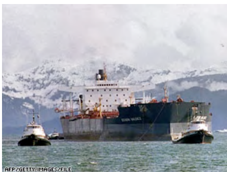
Tugboats pull the Exxon Valdez off Bligh Reef in Alaska's Prince William Sound on April 5, 1989.

WASHINGTON (CNN) -- Nearly 20 years after one of the most infamous environmental disasters scarred Alaska's Prince William Sound, the Supreme Court stepped nearer Wednesday to perhaps providing a measure of closure for the seemingly endless litigation over the Exxon Valdez oil spill.